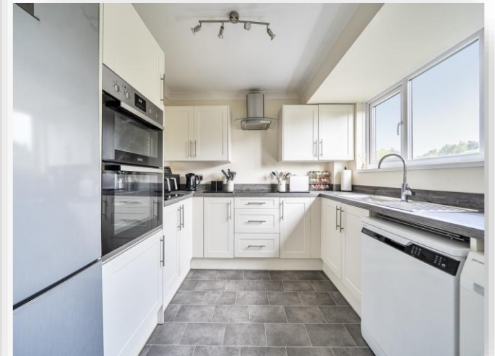
Debney Lodge, Mey Close, Waterlooville PO7 8JF