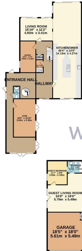
GROUND FLOOR 2501 sq.ft. (232.4 sq.m.) approx.