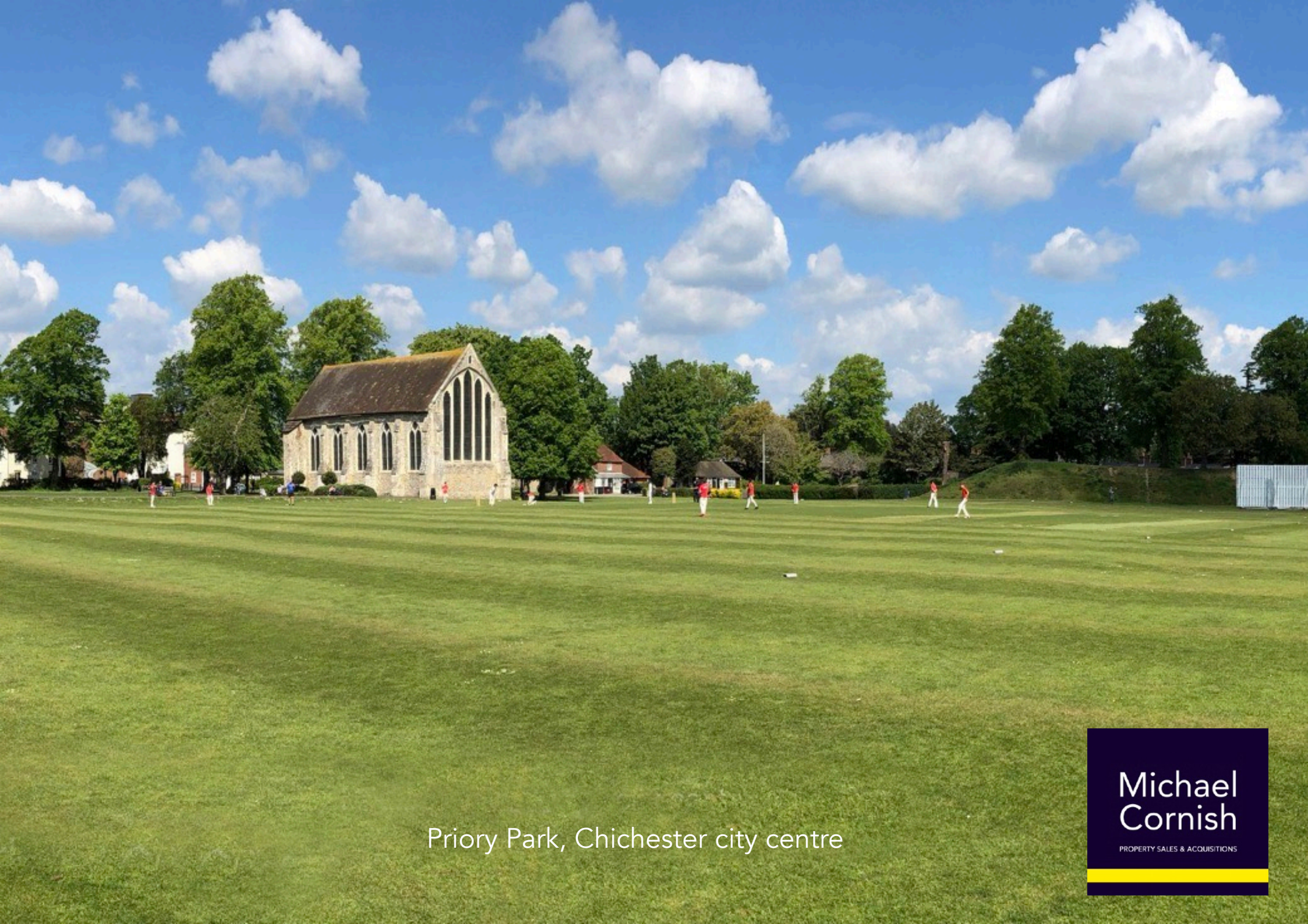
Priory Park, Chichester city centre