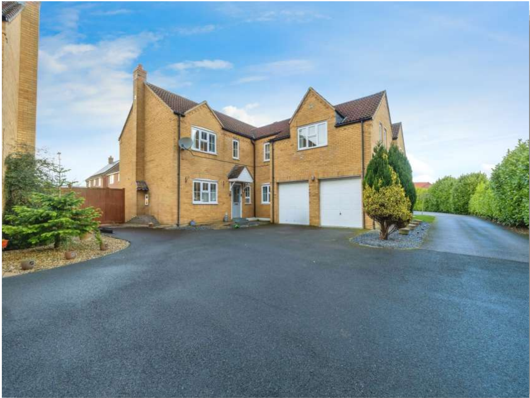
Temple Goring, Navenby LINCOLN LN5 0TX