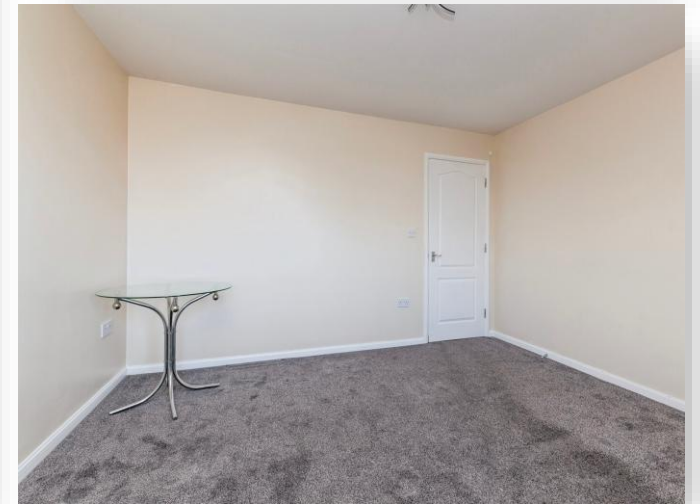
Queens Court Warren Road, Hartlepool TS24 9DP