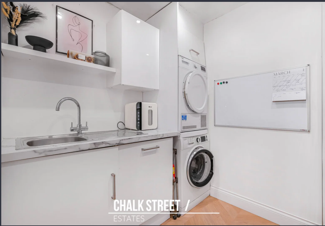
CHALK STREET / ESTATES