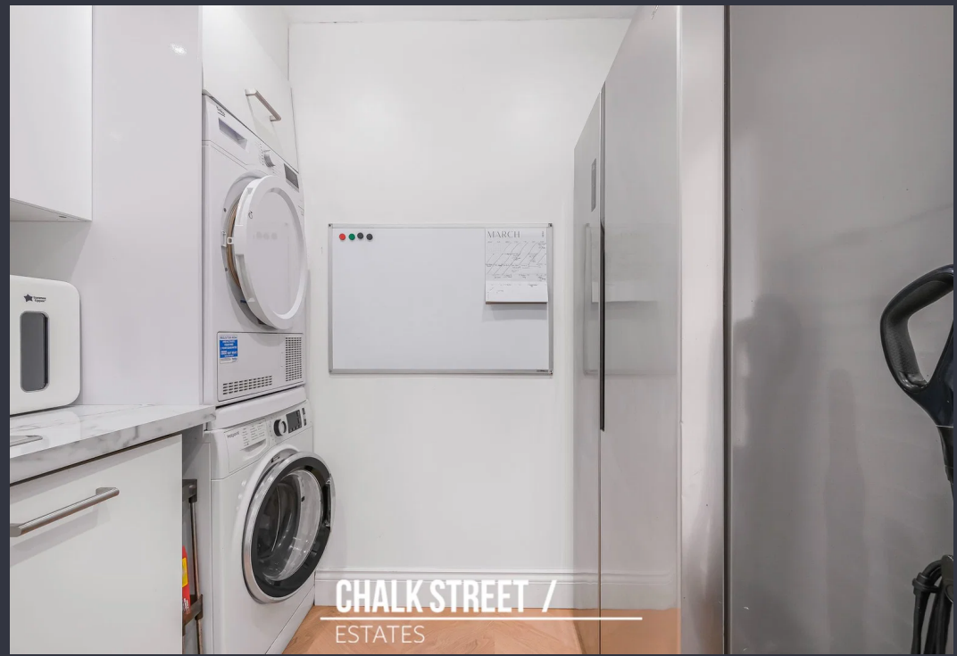
CHALK STREET / ESTATES