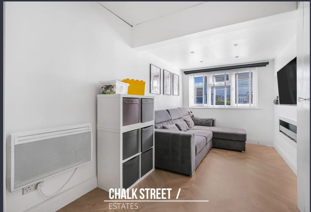
CHALK STREET / ESTATES