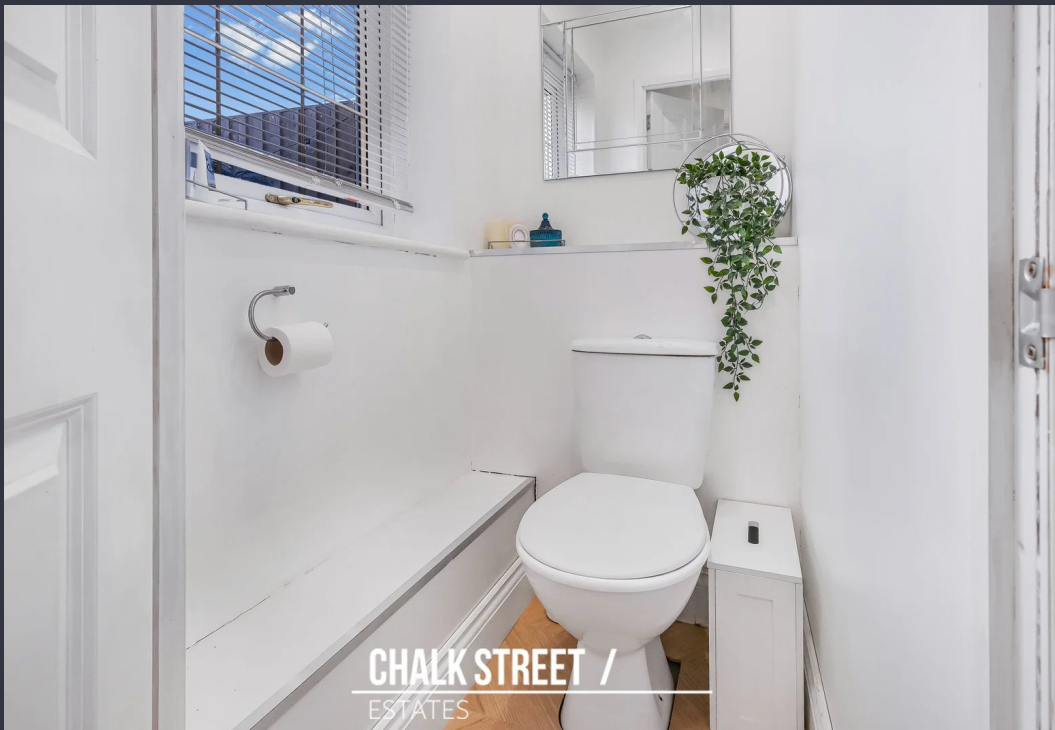
CHALK STREET / ESTATES