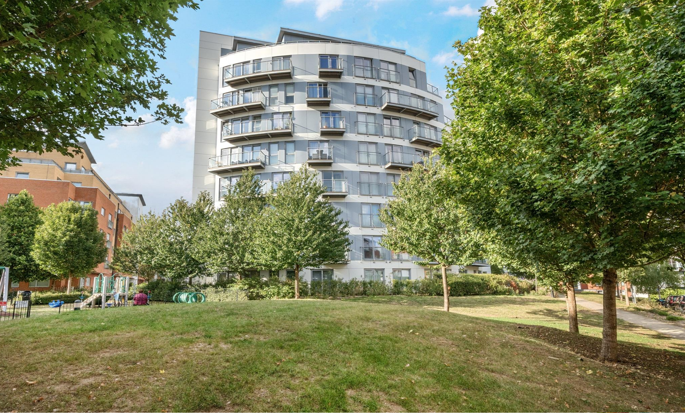
Opus House, Charrington Place, St. Albans AL1 3DB