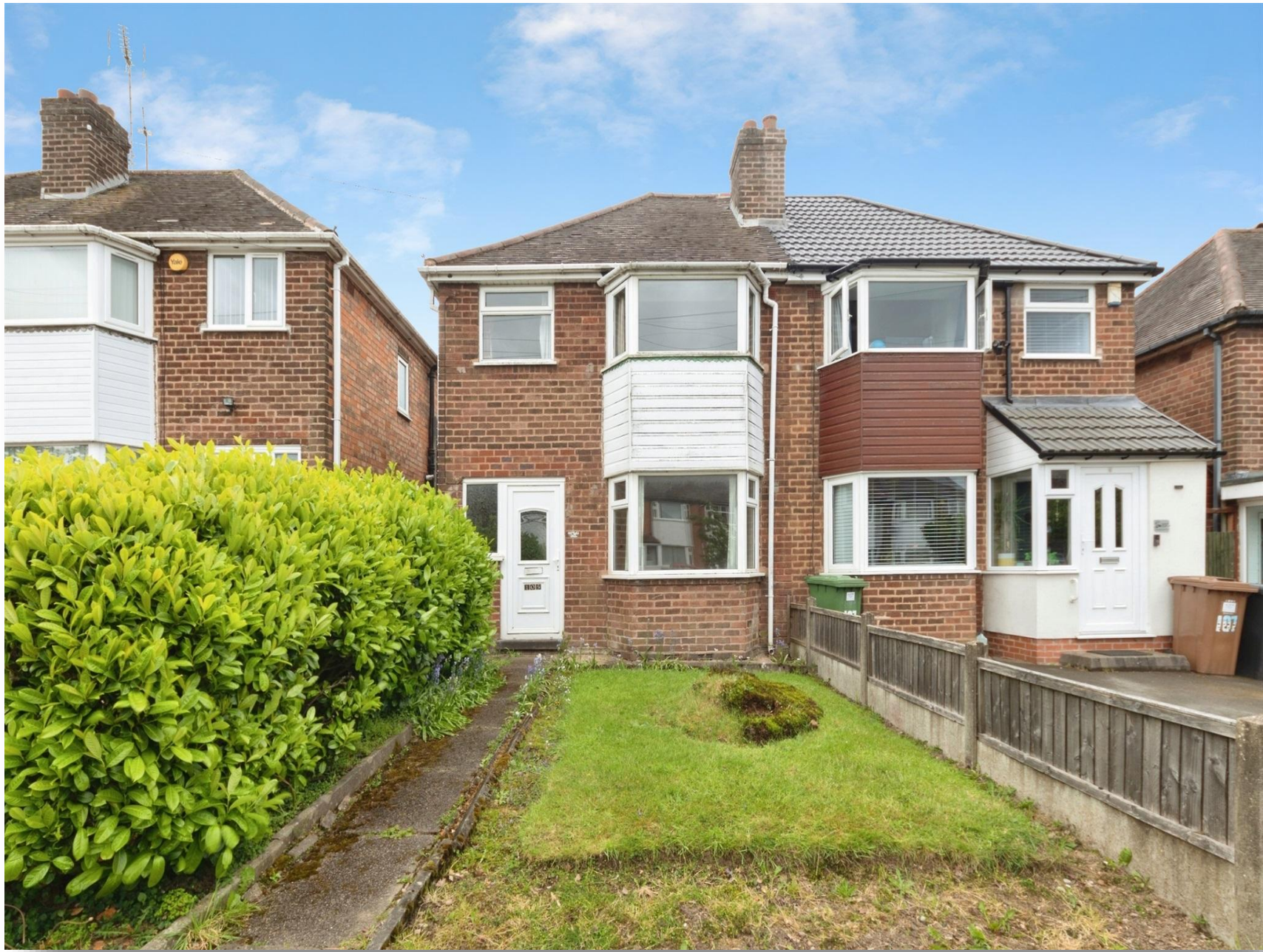
Newborough Road, Shirley Solihull B90 2HE