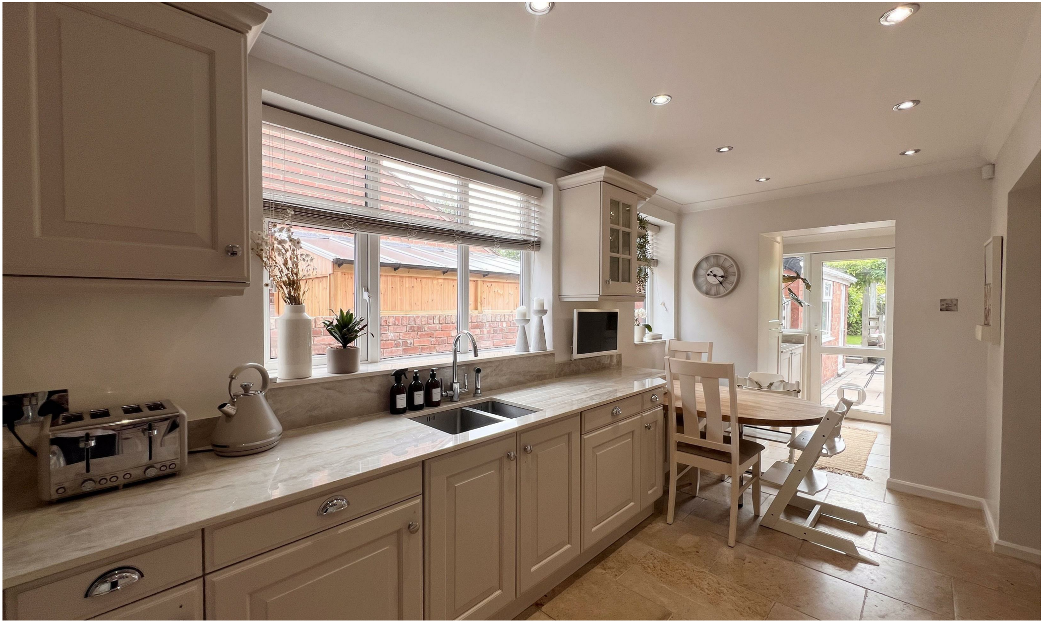
GOLF | CHARLOTTE HOUSE, GROUND FLOOR, 35-37 HOGHTON STREET, SOUTHPORT, MERSEYSIDE, PR9 0NS