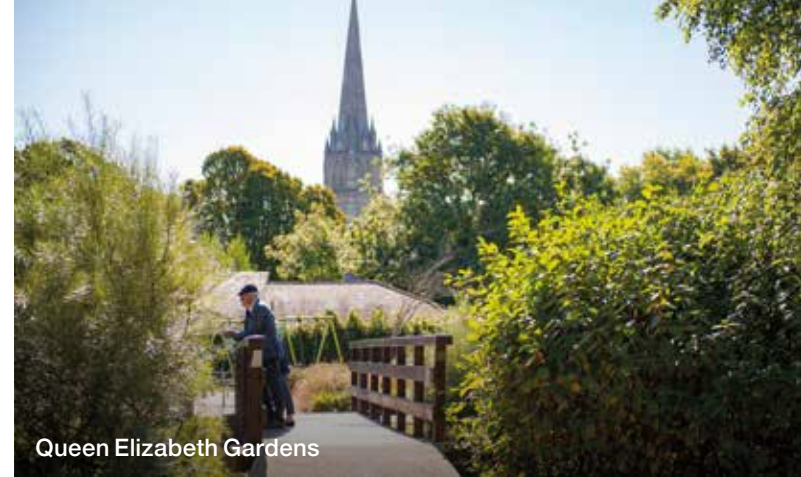
Queen Elizabeth Gardens