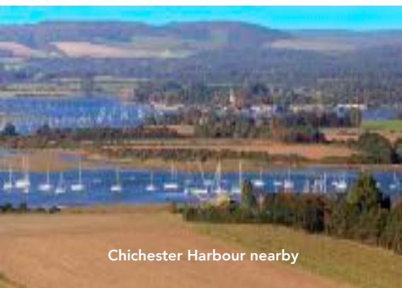
Chichester Harbour nearby