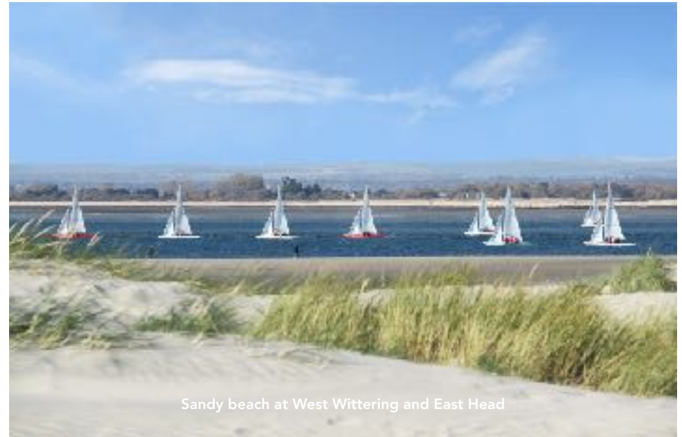
Sandy beach at West Wittering and East Head