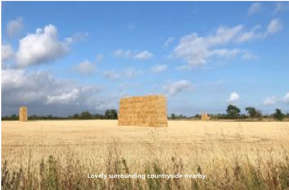
Lovely surrounding countryside nearby

A spacious detached house and annexe in need of modernisation with further potential approx. 2,190 sqft comprising 5 bedrooms, 4 bathrooms, 4 receptions and 2 kitchens, incorporating an Annexe with independent access, well positioned set back on its plot, with plenty of parking space for numerous vehicles and boats, in all grounds of about 0.39 acres.