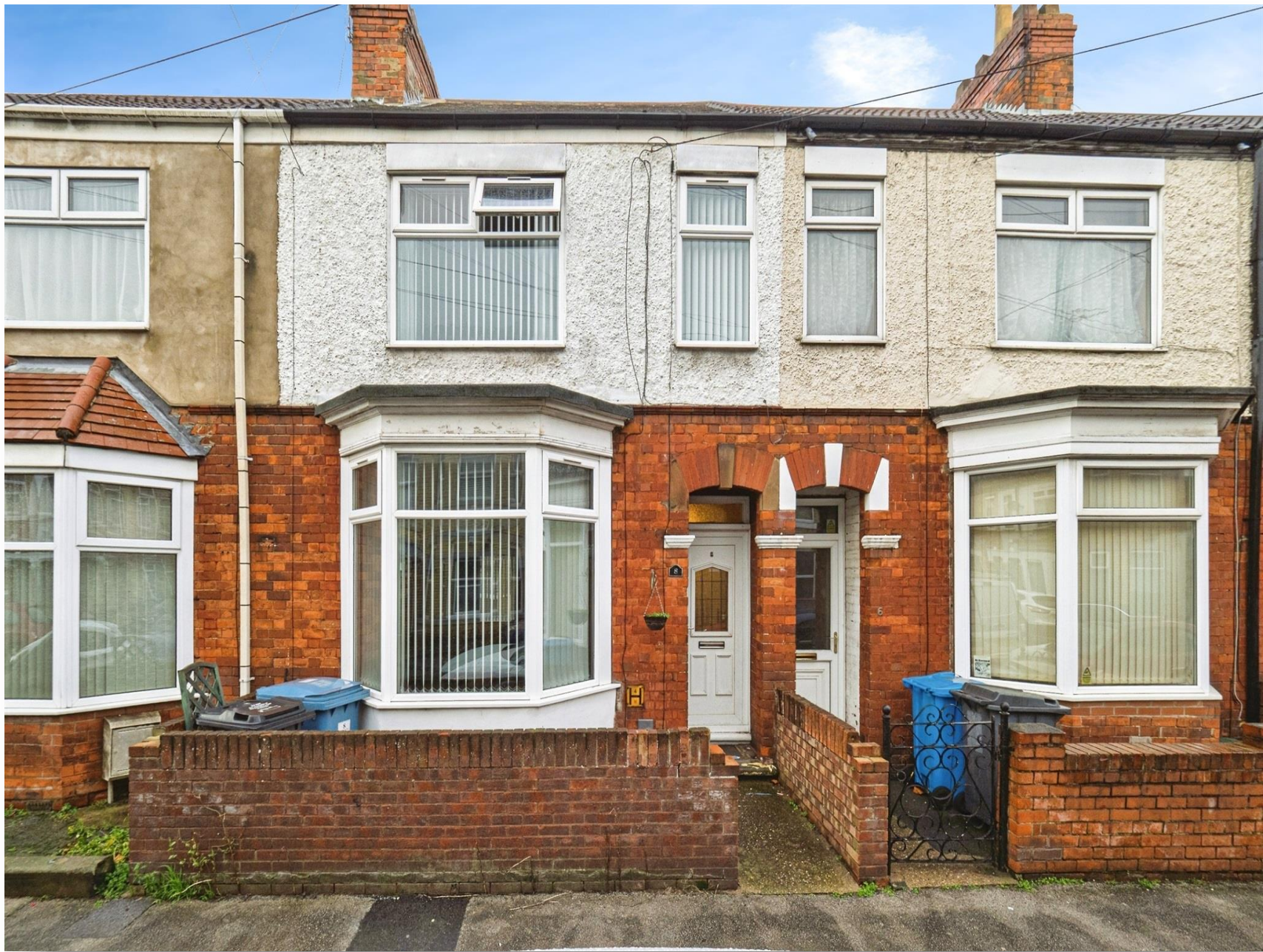
East Park Avenue, Hull, HU8 9AE