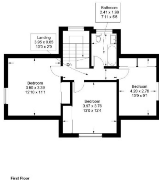
Illustration for identification purposes only, measurements are approximate, not to scale. Fourlabs.co © (1D13D0625)