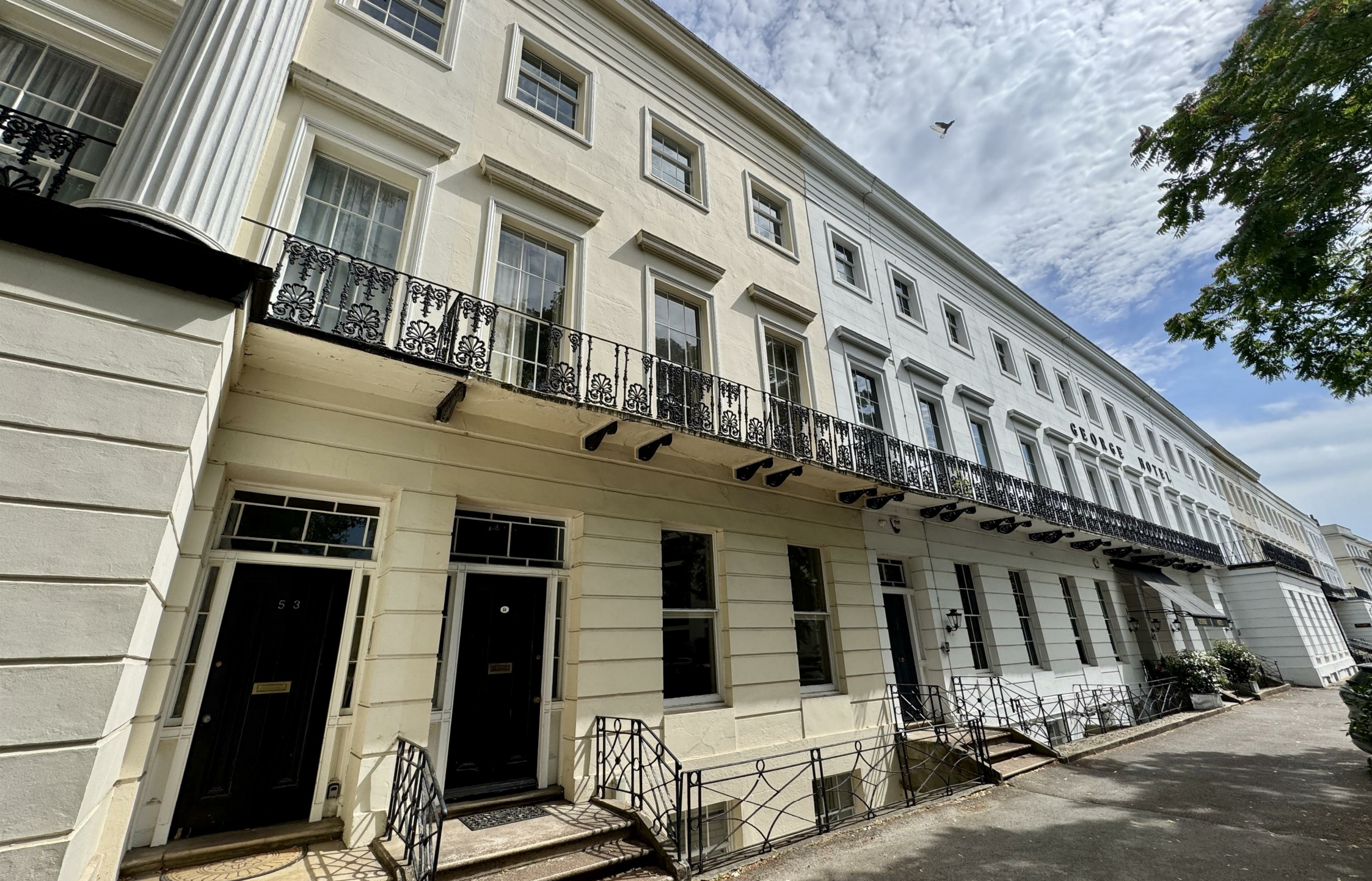
Flat 2, 51 St. Georges Road, Cheltenham, Gloucestershire, GL50 3DU