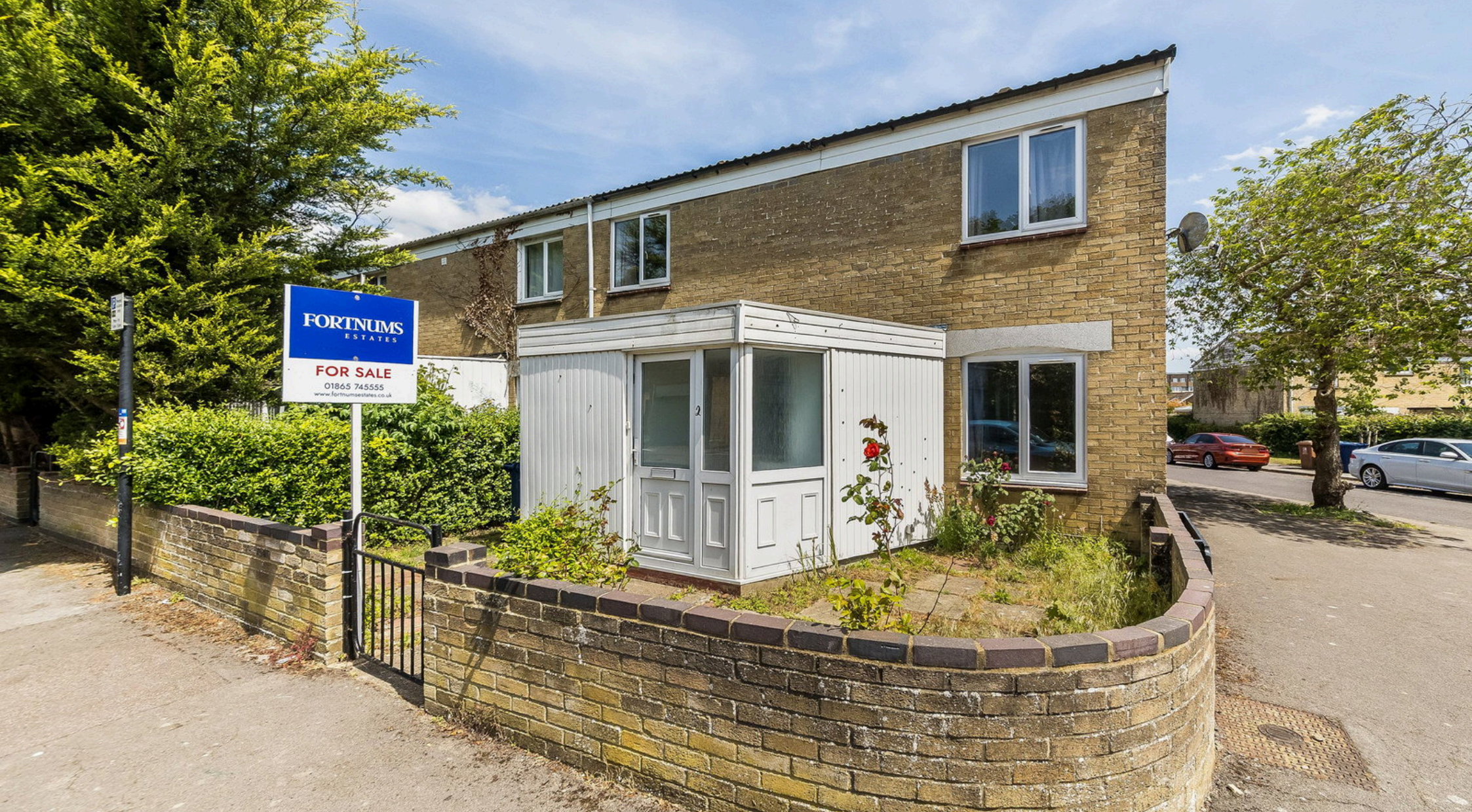
Tilehouse Close, Headington, OX3