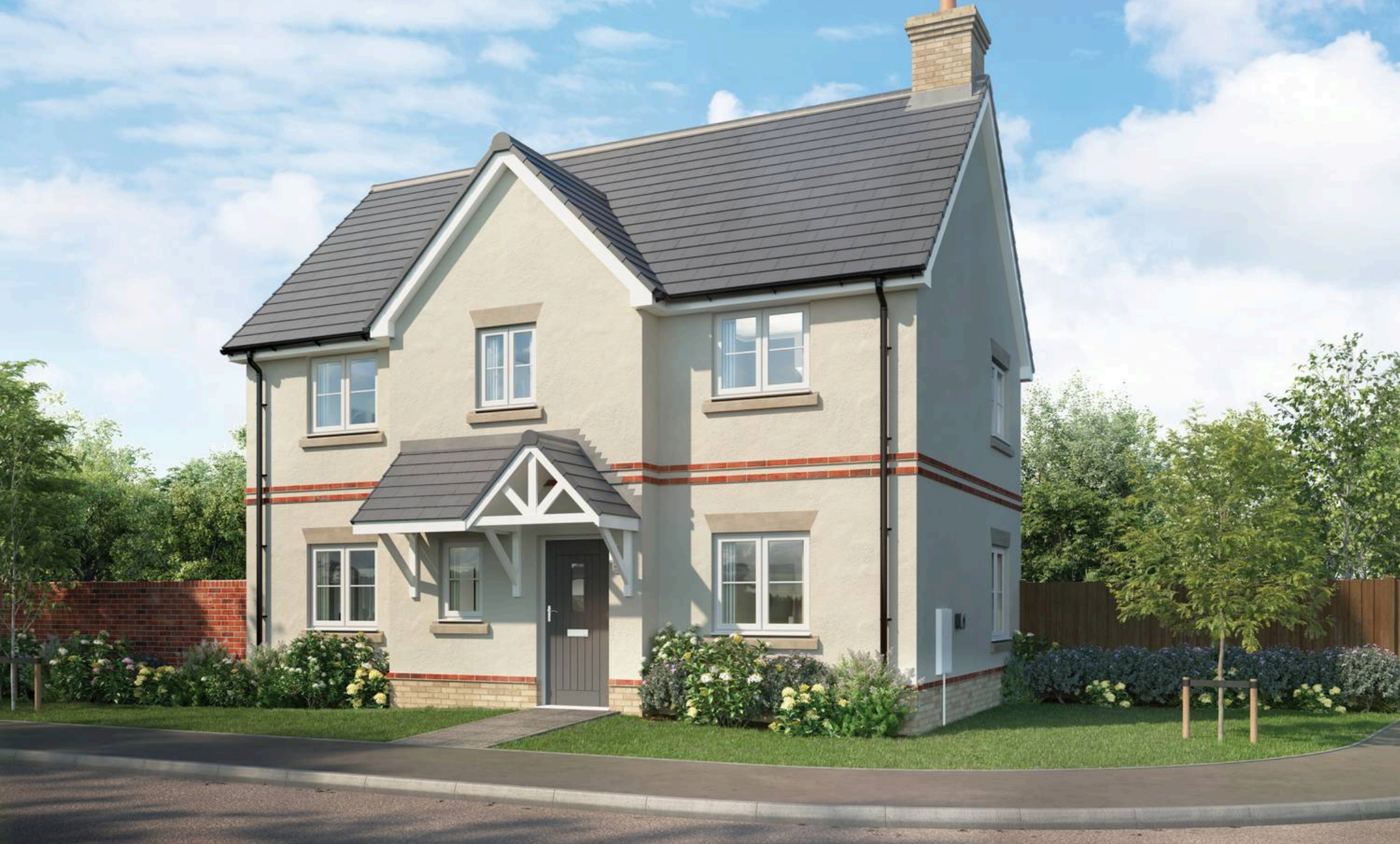
Meadowvale, Calne Road Chippenham