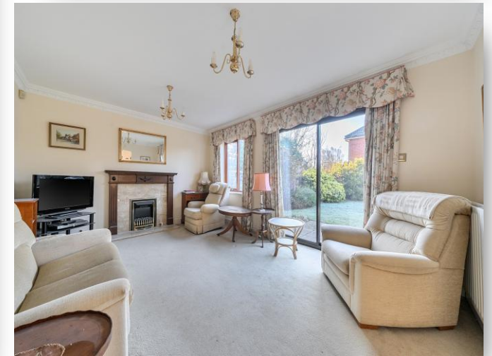
3 Taylors Court, Maidenhead SL6 5BZ