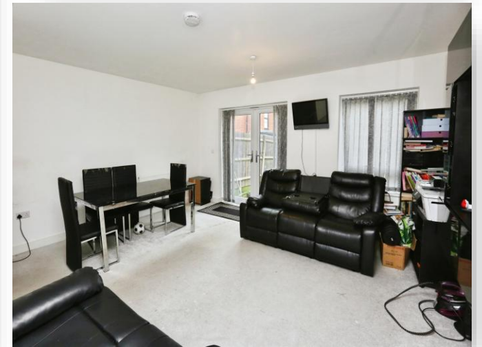
Courageous Road, Lee-On-The-Solent PO13 9GD