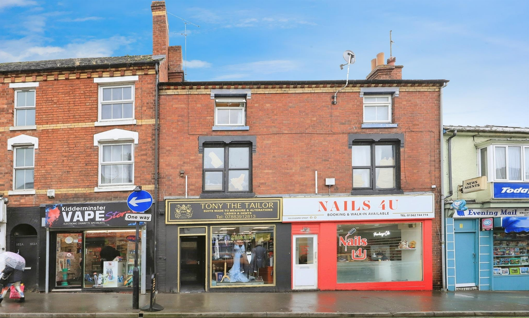
Flat 3 Coventry Street, Kidderminster DY10 2BH