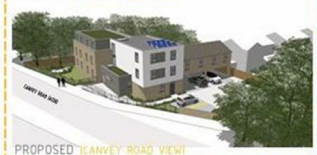
PROPOSED (CANVEY ROAD VIEW)