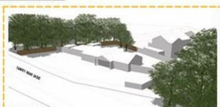
EXISTING (CANVEY ROAD VIEW)