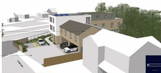
PROPOSED (ST. MARK'S ROAD VIEW)

Existing boundary trees to be protected and retained as shown.