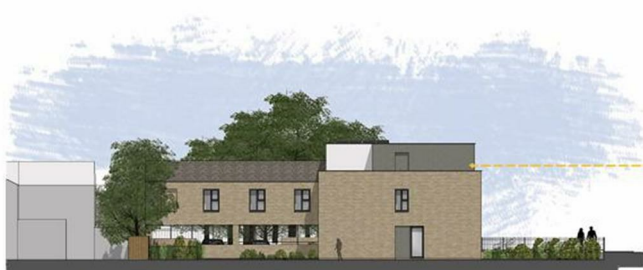
PROPOSED SIDE ELEVATION 1:100

EXIST'G CLADDING: The existing brickwork is to be retained and used as part of the external palette. The quality of the brickwork is to be retained in situ to the top.