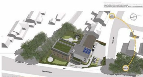
PROPOSED (SCHEMATIC VIEW 2)