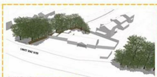
EXISTING (SCHEMATIC VIEW)