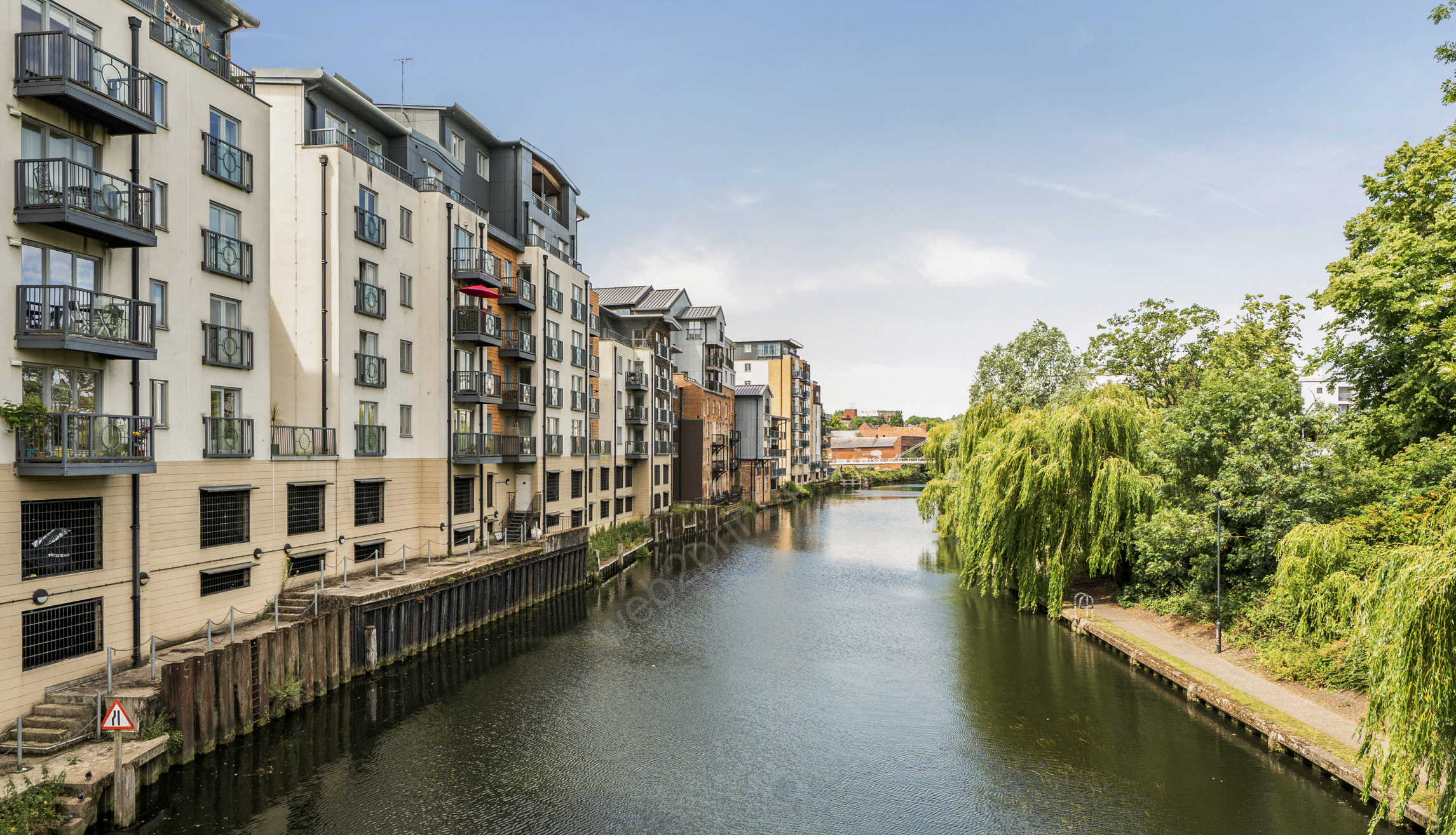
Apartment 3, New Half Moon Yard Norwich, NR1 2TL