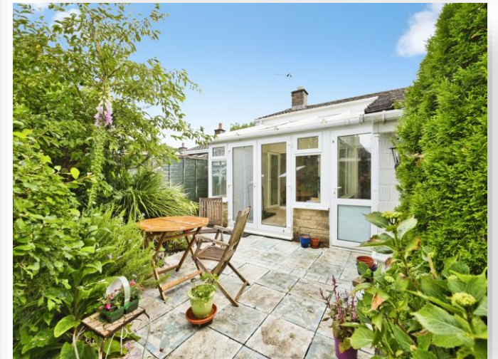
Wesley Close, Wanstrow, Shepton Mallet BA4 4TA