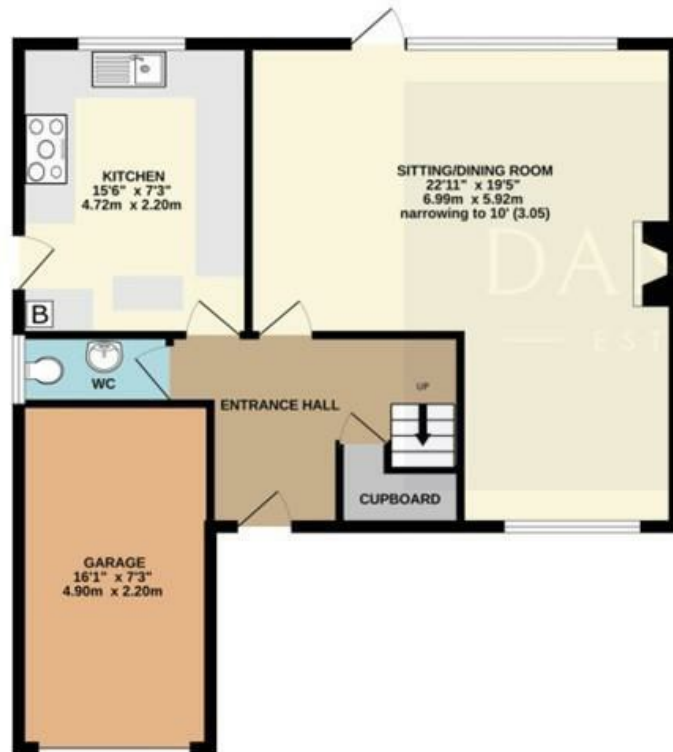
GROUND FLOOR 727 sq.ft. (67.5 sq.m.) approx.