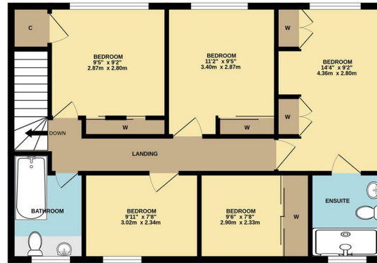
TOTAL FLOOR AREA: 1746 sq.ft. (162.2 sq.m.) approx.

Whilst every attempt has been made to ensure the accuracy of the floorplan contained here, measurements of doors, windows, rooms and any other items are approximate and no responsibility is taken for any error, omission or mis-statement. This plan is for illustrative purposes only and should be used as such by any prospective purchaser. The services, systems and appliances shown have not been tested and no guarantee as to their operability or efficiency can be given. Made with Metropix ©2026