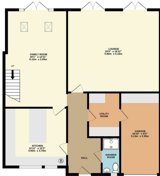
GROUND FLOOR 1053 sq.ft. (97.8 sq.m.) approx.