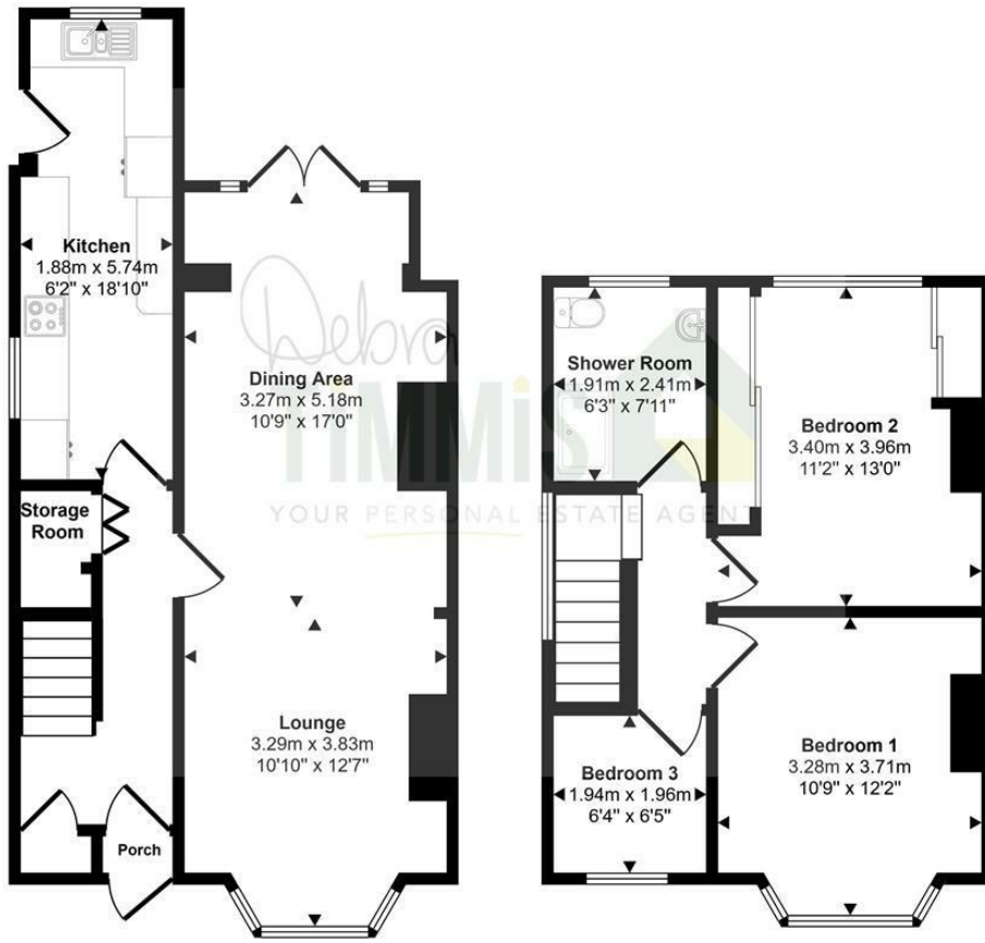
Ground Floor Approx 49 sq m / 530 sq ft

Approx Gross Internal Area 89 sq m / 959 sq ft