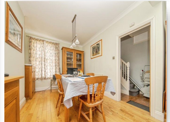
Nacton Road, Ipswich, IP3 9JH