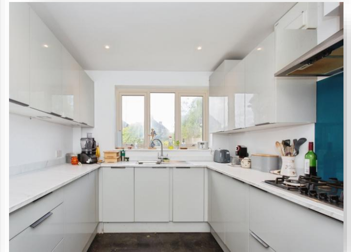
Oakington Road, Cottenham, Cambridge, CB24 8TW