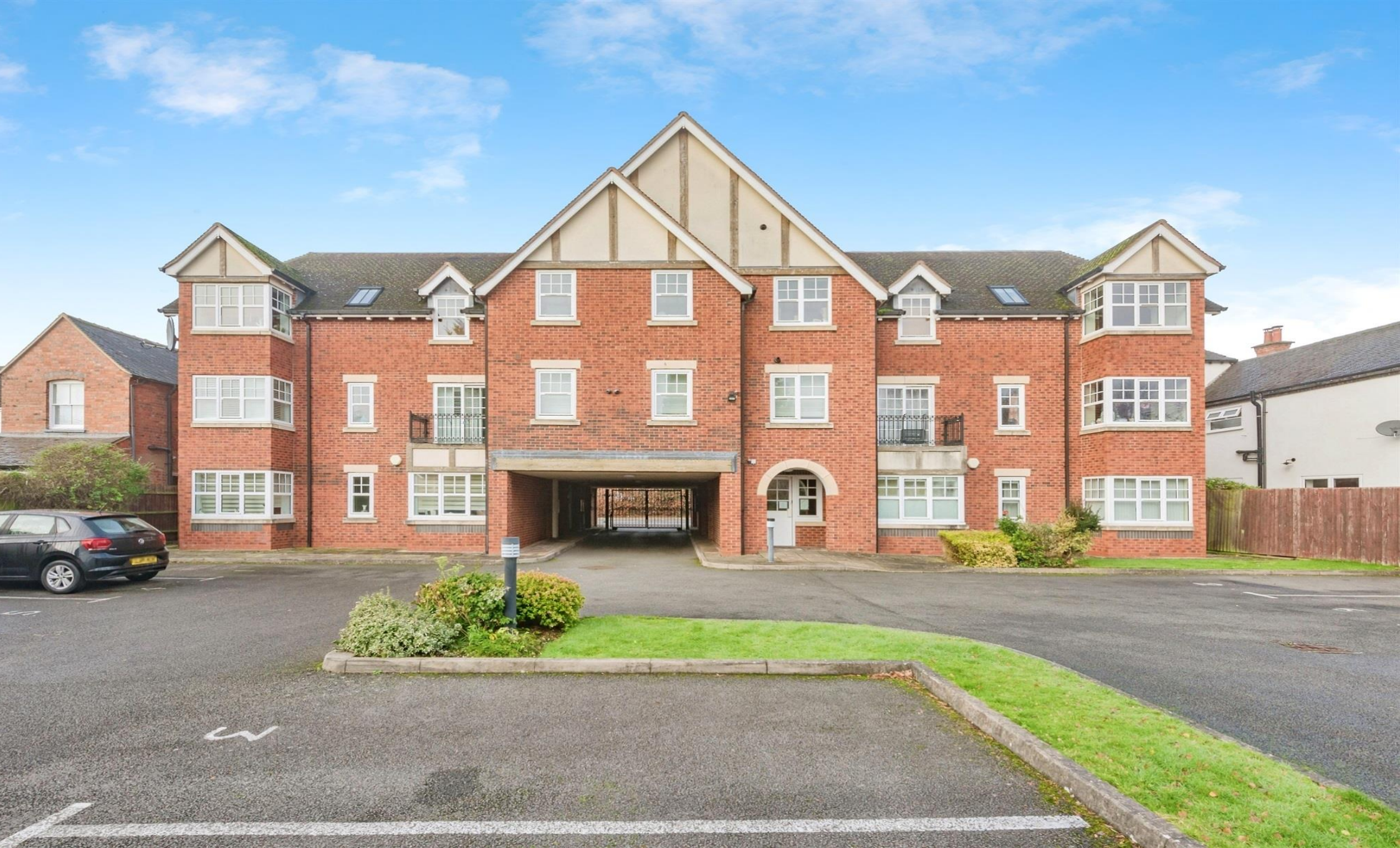
Mair Court, Wigginton Road, Tamworth