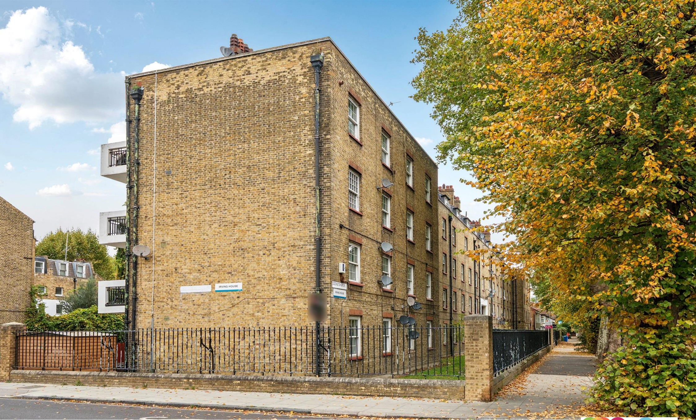
Irving House Doddington Grove, London SE17