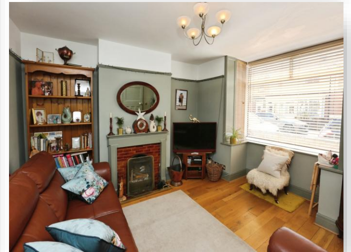
Vernon Road, Gosport PO12 3NT