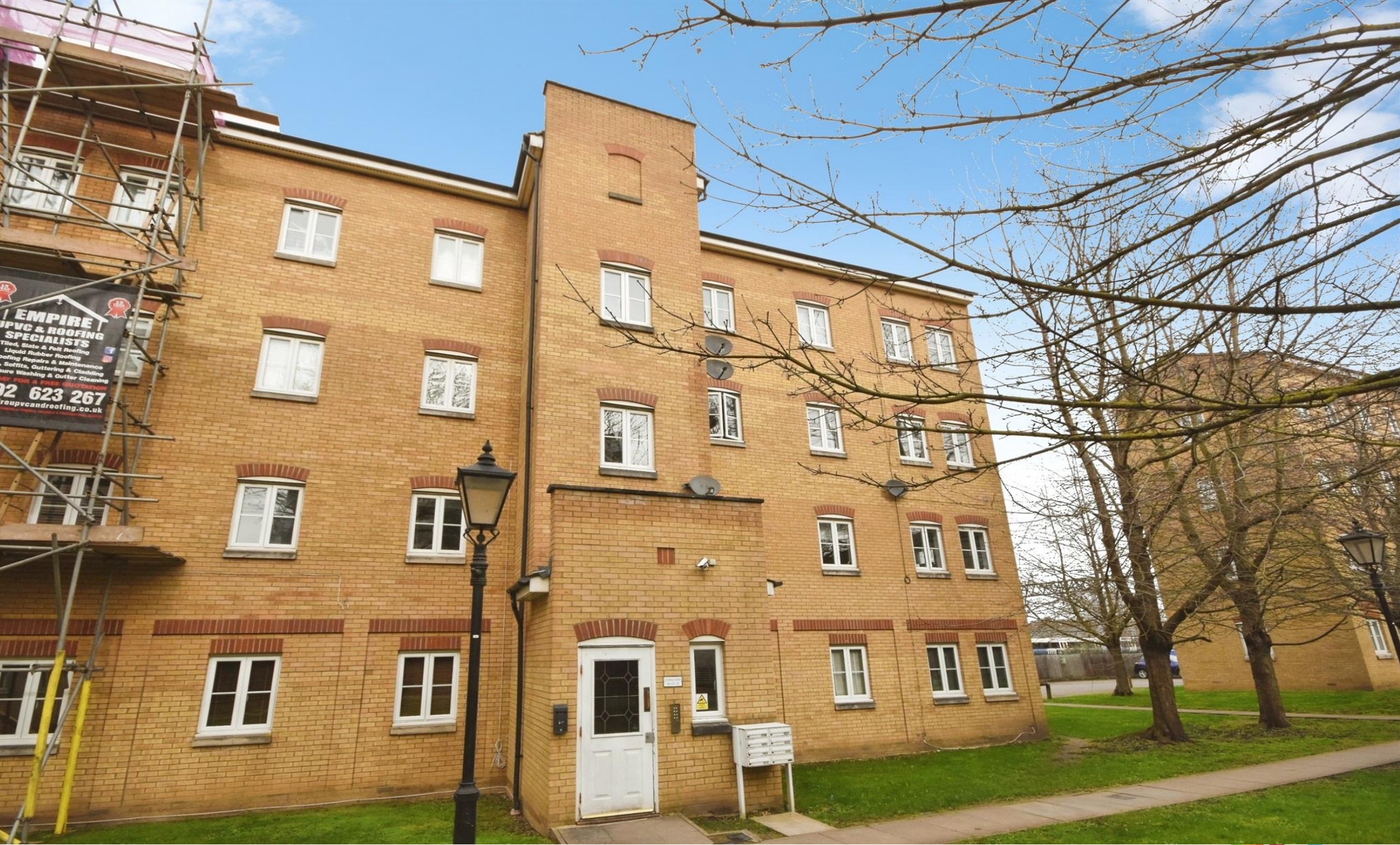
Coopers Court, Kidman Close, Gidea Park, Romford, RM2 6GD