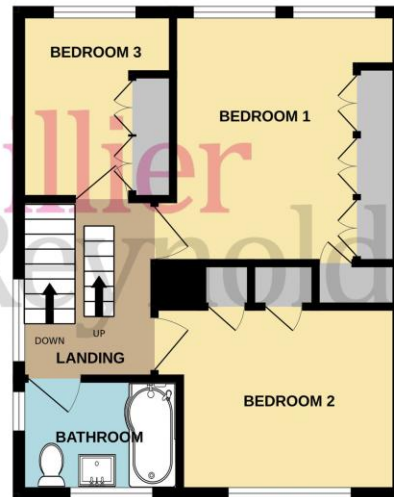
1ST FLOOR 38.4 sq.m. (414 sq.ft.) approx.