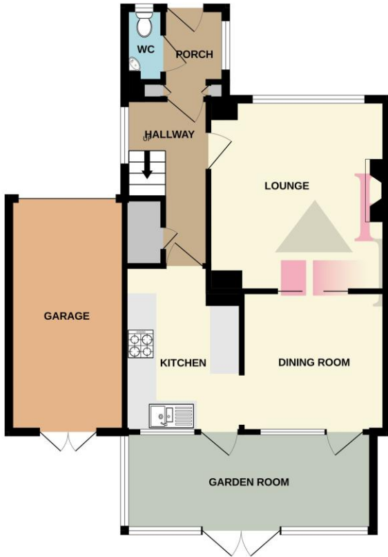
GROUND FLOOR 64.7 sq.m. (696 sq.ft.) approx.