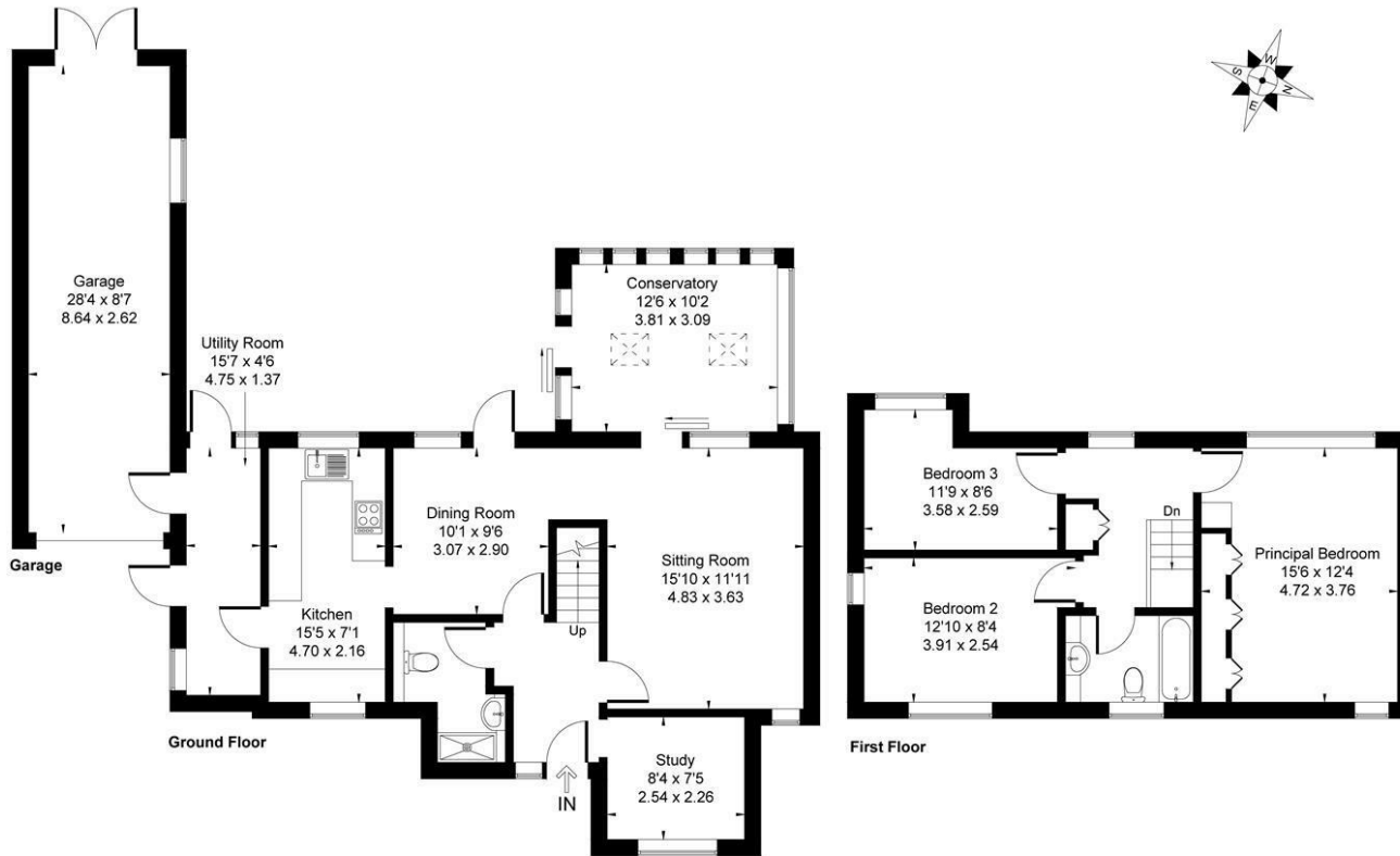
Illustration for identification purpose only, measurements approximate, and not to scale.

Approximate Gross Internal Area Main House = 124.21 sq m / 1337 sq ft Garage = 22.58 sq m / 243 sq ft Total = 146.79 sq m / 1580 sq ft