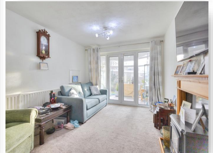
Langham Road, Raunds NN9 6LD