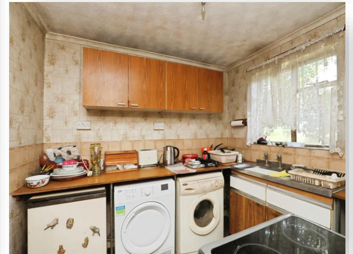
Thursford Road, Great Snoring Fakenham NR21 0HW