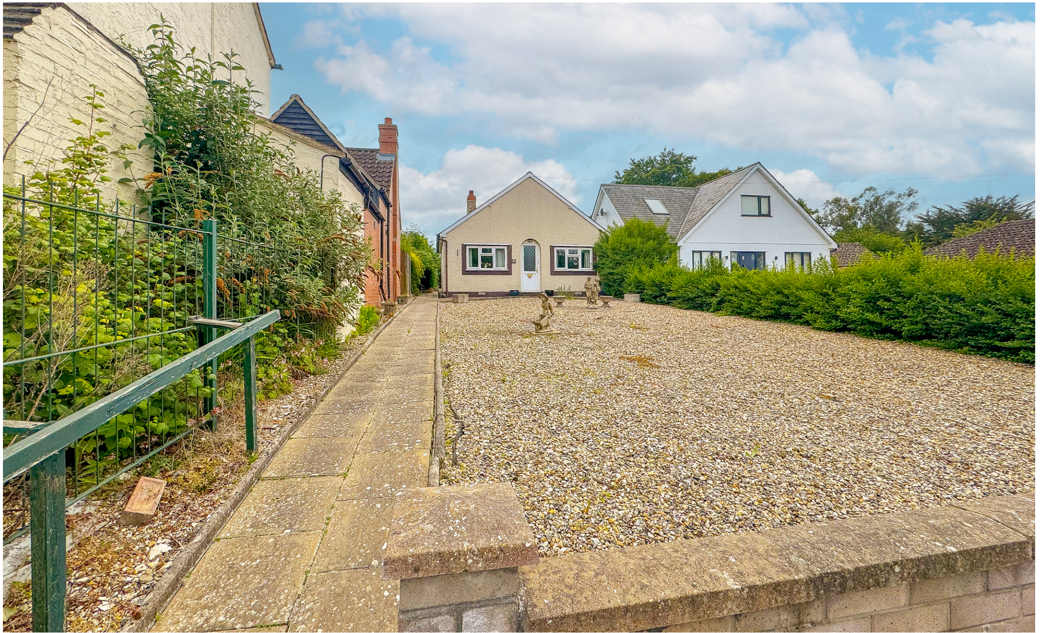
Church Street, Fordham, Ely, Cambridgeshire