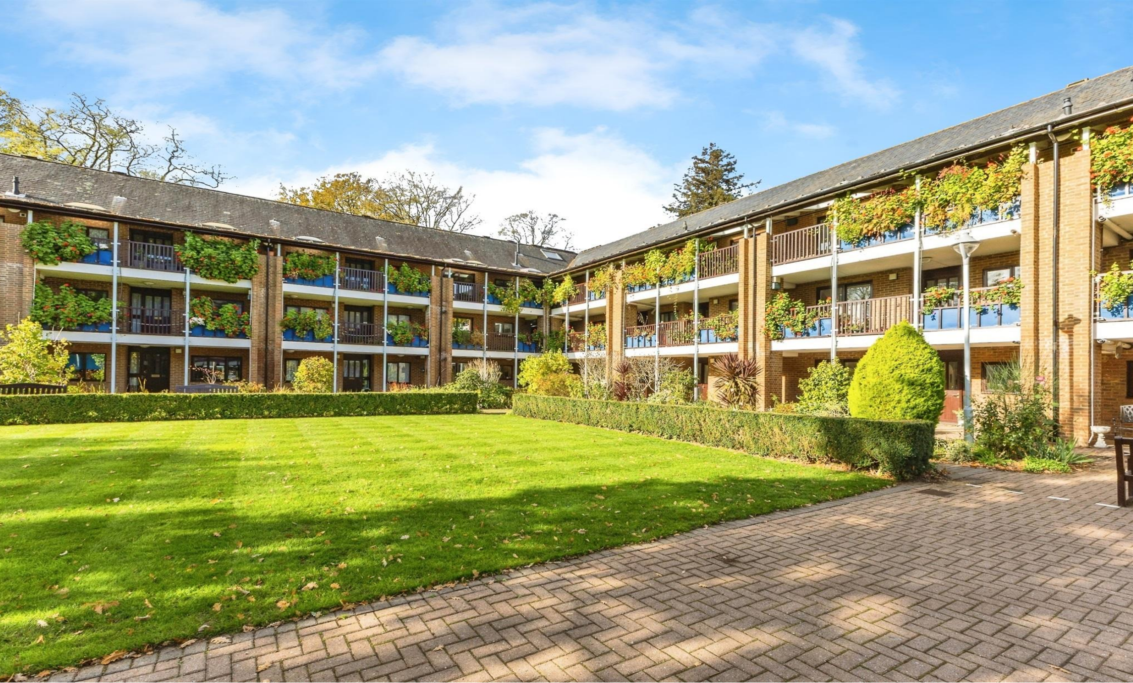
Emmbrook Court, Reading RG6 5TZ