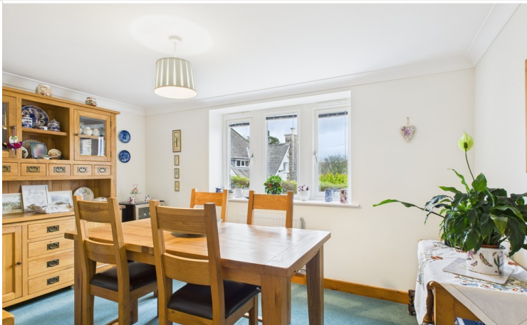
Bedroom Three/Dining Room