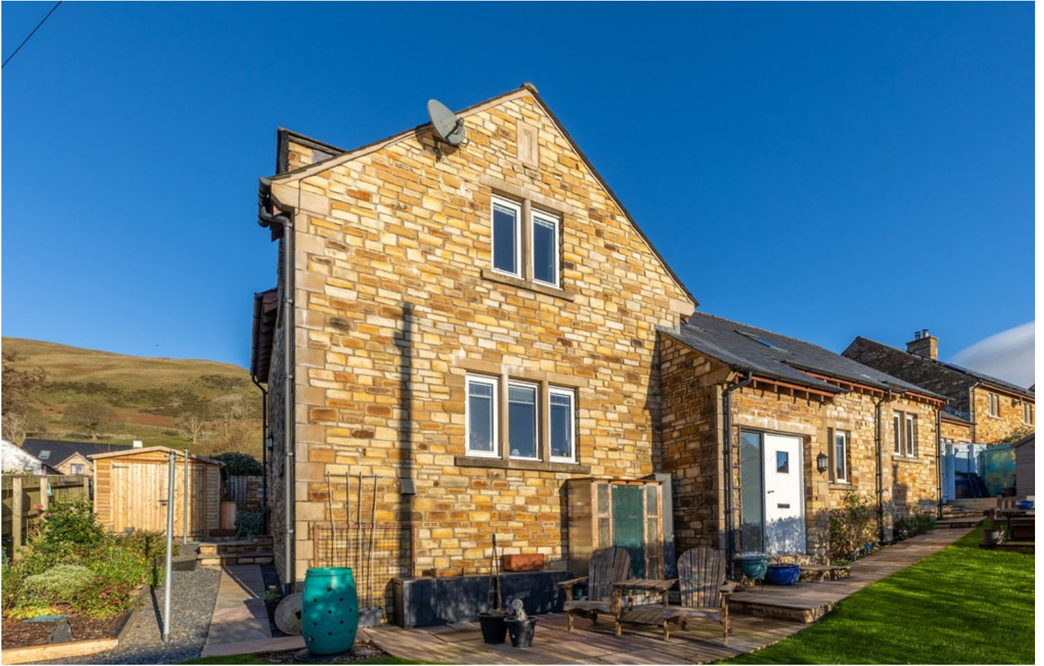
19 Winfield Road