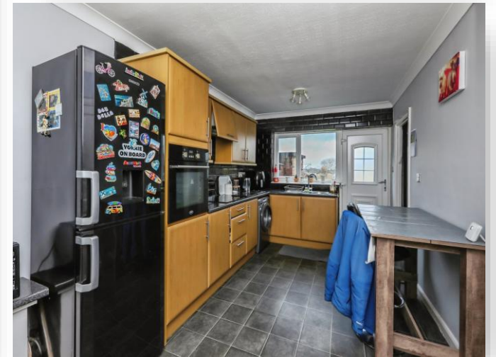
Fullerton Avenue, Conisbrough DONCASTER DN12 3PQ