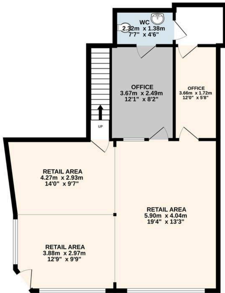
GROUND FLOOR 72.0 sq.m. (775 sq.ft.) approx.