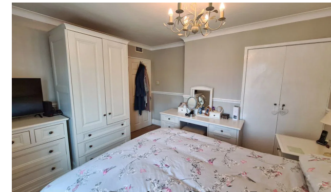
Trusted. Award Winning. Experts.