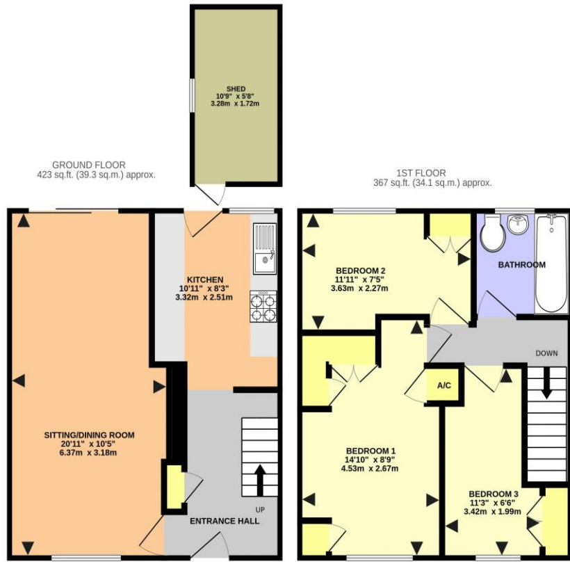
HIDALGO COURT, HEMEL HEMPSTEAD HP2 5NZ (PRODUCED FOR MICHAEL ANTHONY)

TOTAL FLOOR AREA: 790 sq.ft. (73.4 sq.m.) approx. No accuracy to this image, text or measurements is guaranteed Made with Metropix ©2025