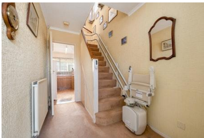
Entrance Hall 1.81m x 4.21m (5'11" x 13'10")