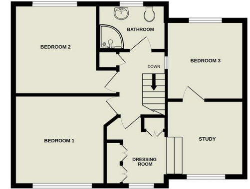
TOTAL FLOOR AREA : 1043 sq.ft. (96.9 sq.m.) approx.

Whilst every attempt has been made to ensure the accuracy of the floorplan contained here, measurements of doors, windows, rooms and any other items are approximate and no responsibility is taken for any error, omission or mis-statement. This plan is for illustrative purposes only and should be used as such by any prospective purchaser. The services, systems and appliances shown have not been tested and no guarantee as to their operability or efficiency can be given. Made with Metroplan ©2026.