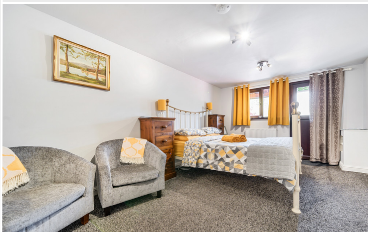
Annex Bedroom Suite