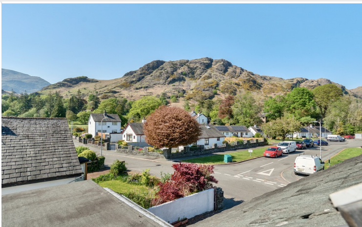
View from Attic

Welcome in to this lovely home, the front entrance leads you down the hall, where you will find space to kick off muddy boots and hang up your coats, step in to a comfortable and very spacious L shaped living room, with incredible Coniston Fell views from the deep bay fronted window complete with a window seat from which one can enjoy the magnificent view. There is a stylish fireplace with a gas fire and decorative surround and the natural hard wood flooring is both practical and stylish. This is a great space to for entertaining friends and family alike or simply relaxing after a long day ambling in the fells. From the lounge there is a concealed electronically controlled retractable ladder for access to the attic space.