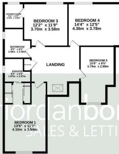
1ST FLOOR 963 sq.ft. (89.5 sq.m.) approx.