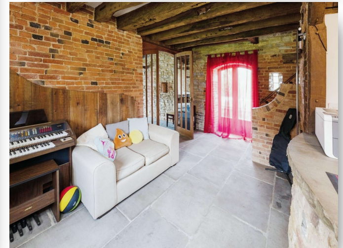
The Dovecote House Bakers Lane, Westborough NEWARK NG23 5HL