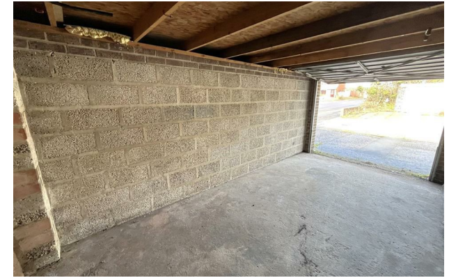
GARAGE 140 sq.ft. (13.0 sq.m.) approx.