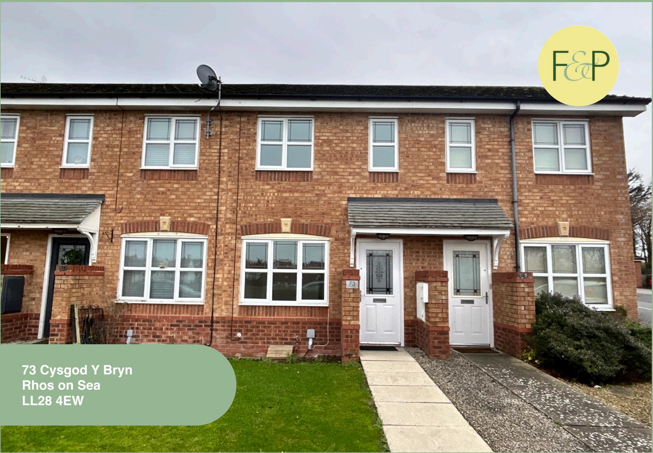
73 Cysgod Y Bryn Rhos on Sea LL28 4EW