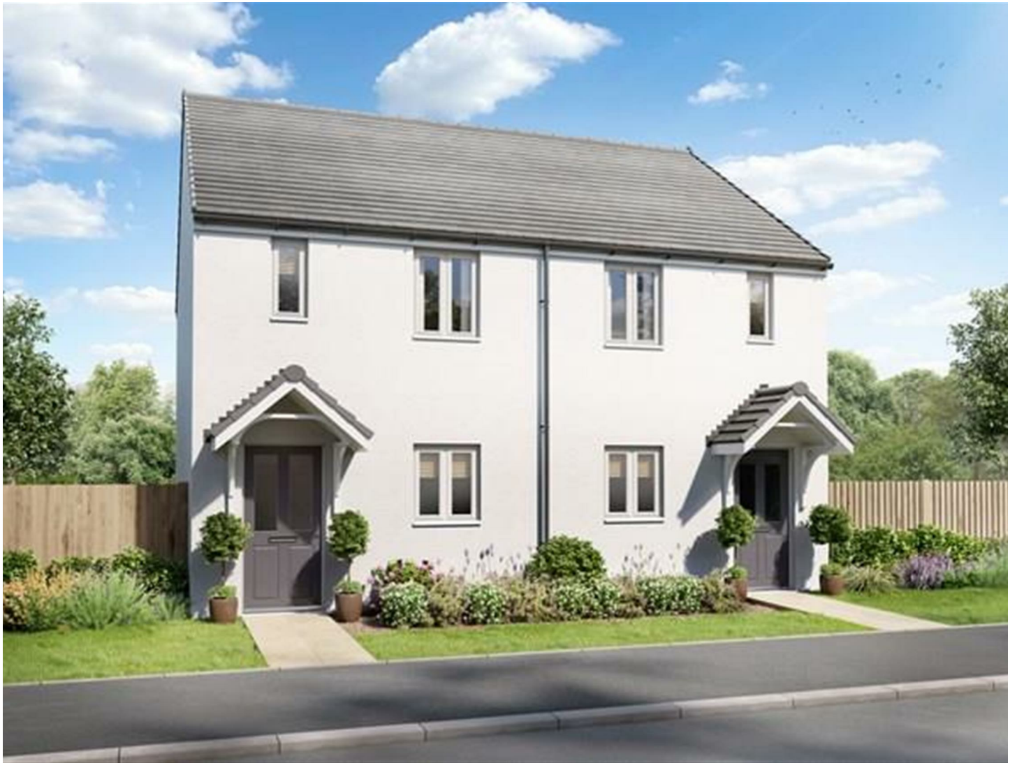
The Alnmouth, plot 402